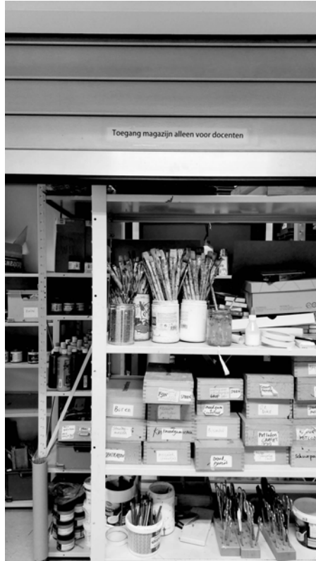
Fig. 3: Storeroom in school 2.

from the other classrooms: the same wooden door, the same side window with the same translucent lilac strip showing the room number.